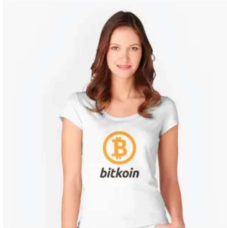
Fitted Scoop T-Shirt

Long sleeve soft tee, crew neck, slim fit