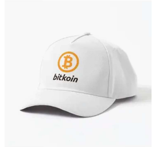
Baseball Style Cap