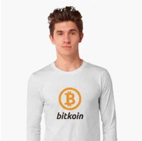
Long Sleeve T-Shirt

Long sleeve soft tee, crew neck, slim fit