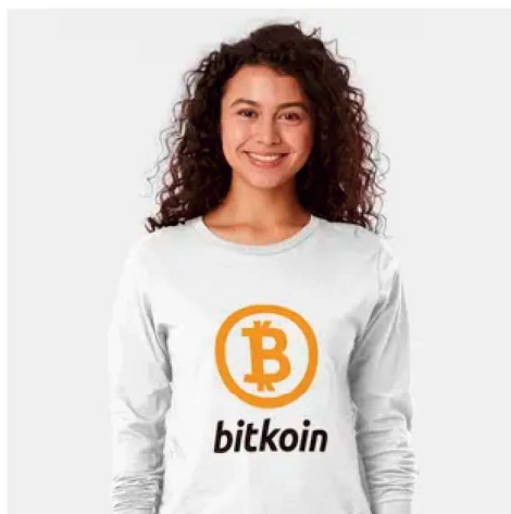
Long Sleeve T-Shirt

Long sleeve soft tee, crew neck, slim fit