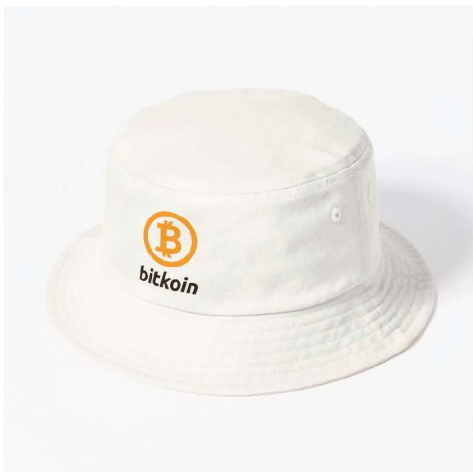
Adventure Bucket Hat

Breathable 100% cotton with eyelet ventilation